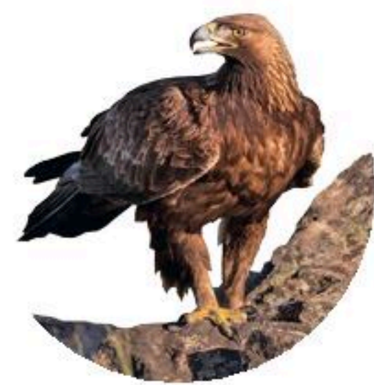
RED BOOK GOLDEN EAGLE