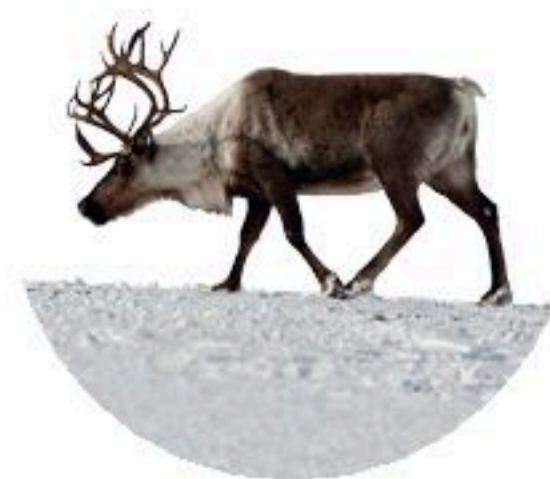
RANGIFER (WILD REINDEER)